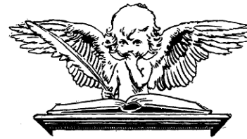
It was Edna's first day as stand-in for the recording angel and already her spelling was causing trouble.

Your loving uncle, Eustace