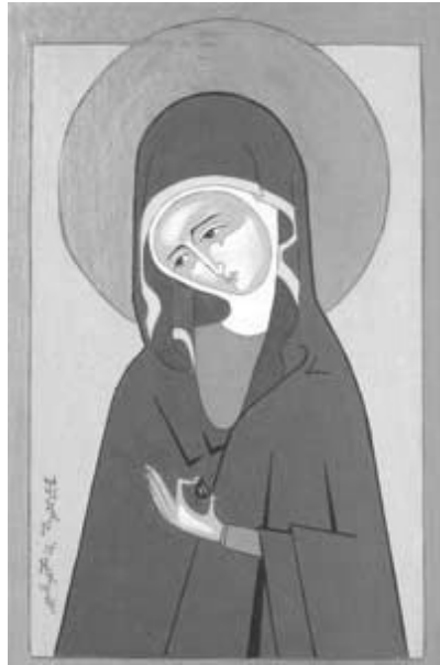
Icon of Julian holding a hazelnut

The first of the sessions covered Julian's vision of the hazelnut. Julian writes: "He showed me something small, no bigger than a hazelnut, lying in the palm of my hand, and I perceived that it was as round as any ball. I looked at it and thought: What can this be? ... In this little thing I saw three properties. The first is that God made it, the second is that he loves it, the third is that God preserves it. But what is that to me? It is that God is the creator and the lover and the protector." (From the Short Text: chapter 4.) This shows Julian's understanding of the value of creation in the eyes of God.