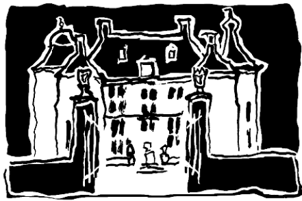
Castle - Waddam