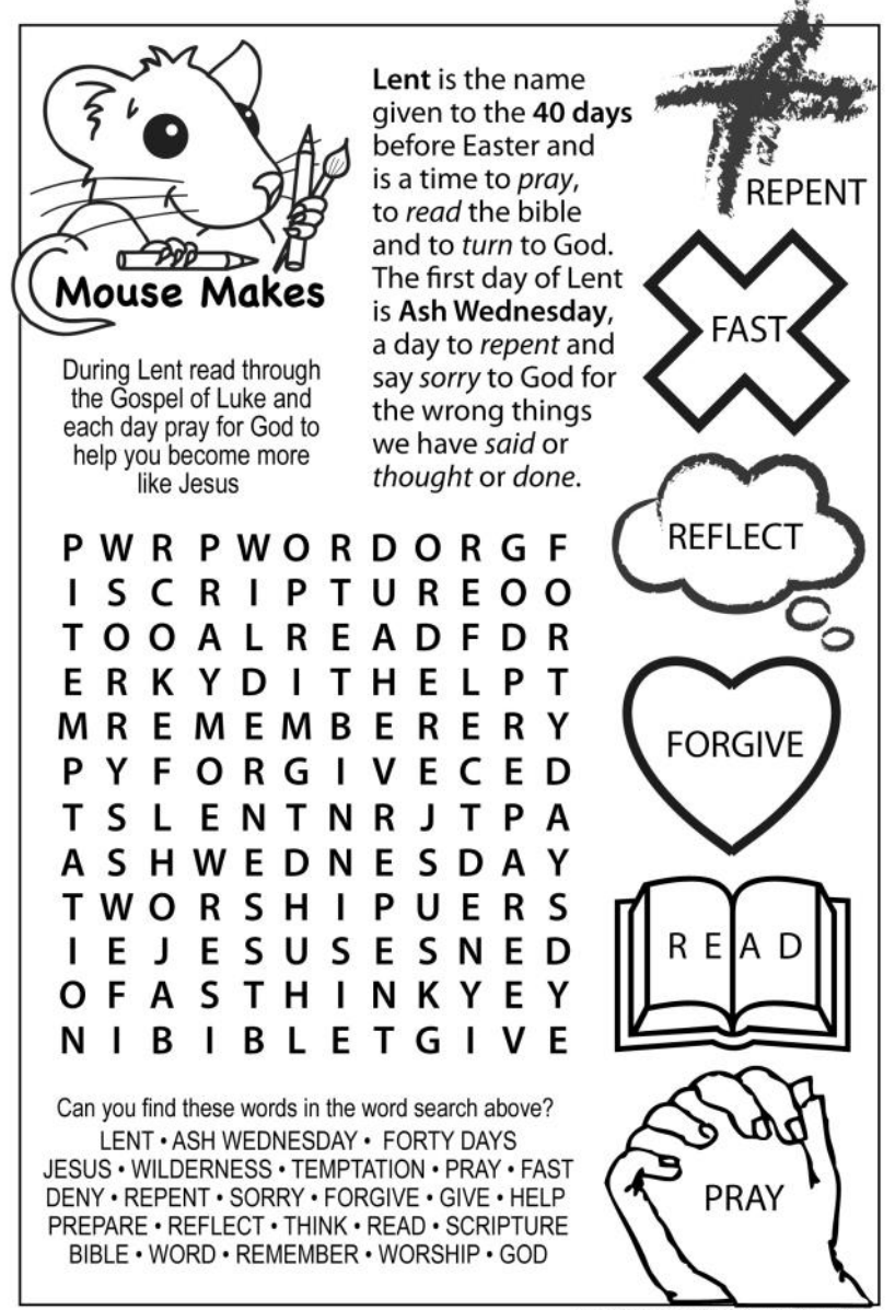
Mar19 C deborah noble · parishpump.co.uk