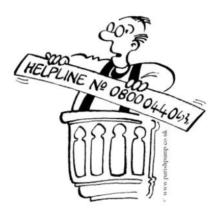
...if you have been affected by any of the issues raised in this sermon...